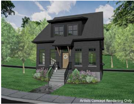
Artists Concept Rendering Only