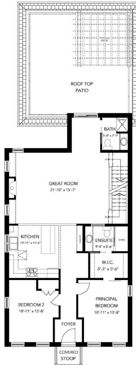
MAIN FLOOR 1,323 sq. ft.